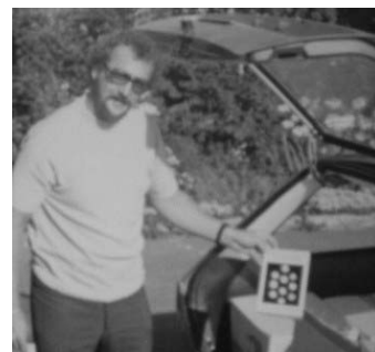
Delivery of my first book